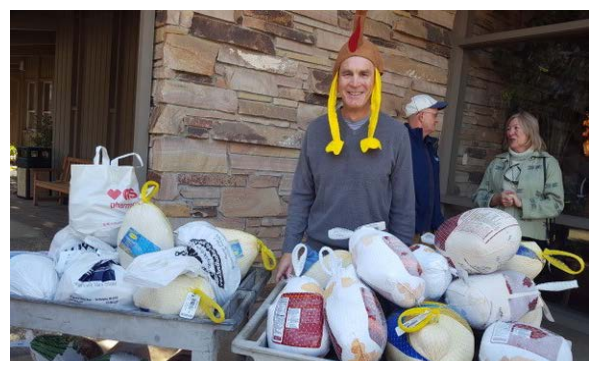
Collecting turkeys for Thanksgiving

Bethel is always looking for additional ways to serve within Bethel, in our Cupertino community and outside our local community. Please contact me with ideas you have for one-time projects, ministries to consider, and an organization to support through Bethel's monthly special designated offering.